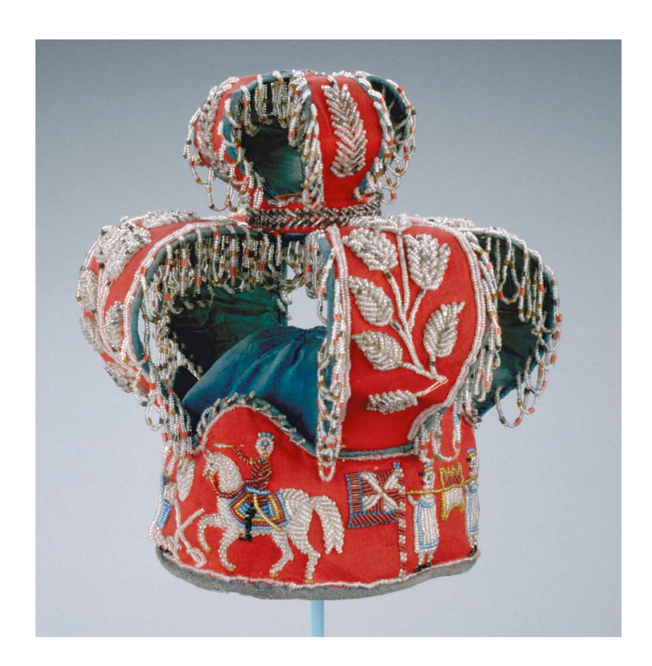
Why Bead a Crown?

This beaded crown is an excellent example of creativity using glass beads on "new" object, while keeping within the boundaries of a "traditional style".