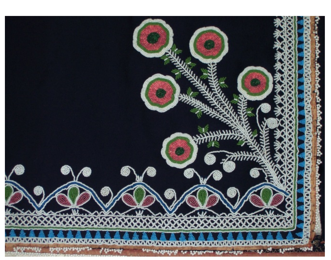
Tree of Life

This design is based upon the cultural symbol of the Tree of Peace – a tall white pine, from which four roots of peace grow. The weapons of war – war clubs – are buried under these roots.